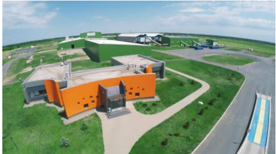
Maïsadour Semences factory in Moguilev (Ukraine)

Seed production: 40% of the workforce | 500 multiplier farmers