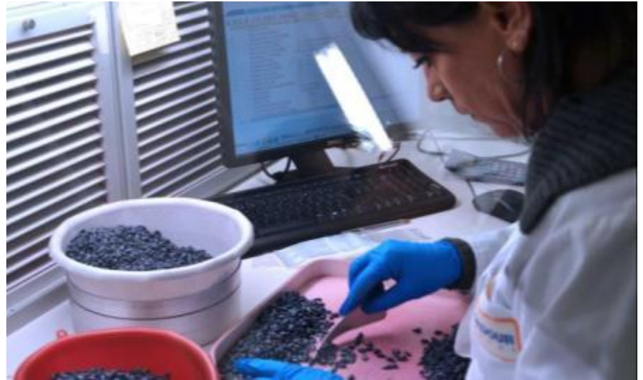
A thorough quality control system

Seed production: 40% of the workforce | 500 multiplier farmers